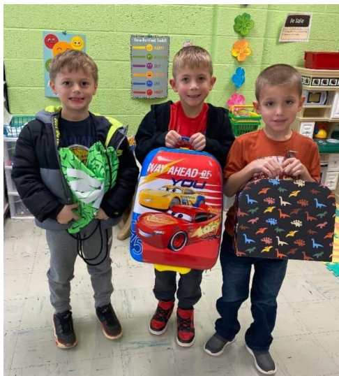
"Anything But a Backpack" Day